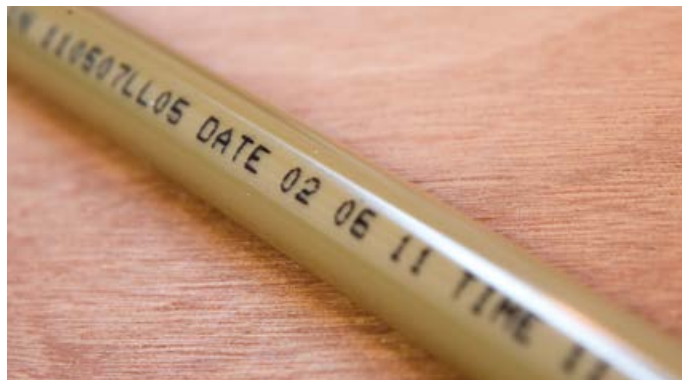
Products made from Victrex materials may be marked by printing or laser marking.