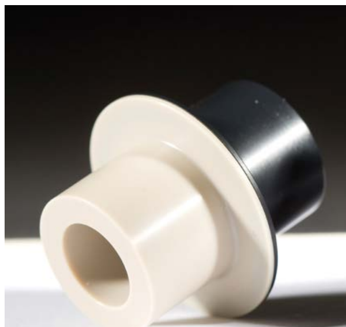
Precise joining of naturally coloured and black Victrex PAEK parts can be achieved through laser welding.

For all welding methods, Victrex suggests working with welding equipment suppliers who have experience with welding our materials. Please contact Victrex technical service for recommendations on welding methods, joint designs, and welding service or equipment providers.