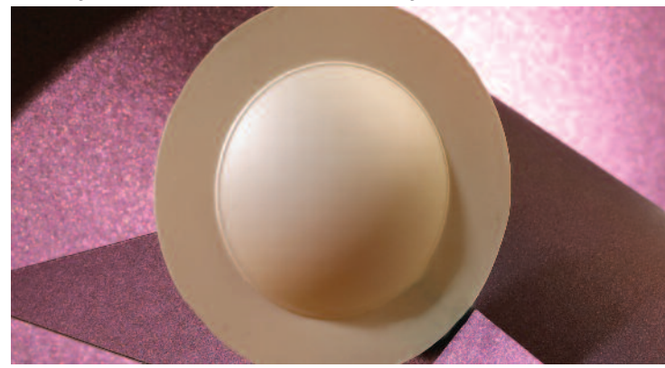
Compression driver diaphragm