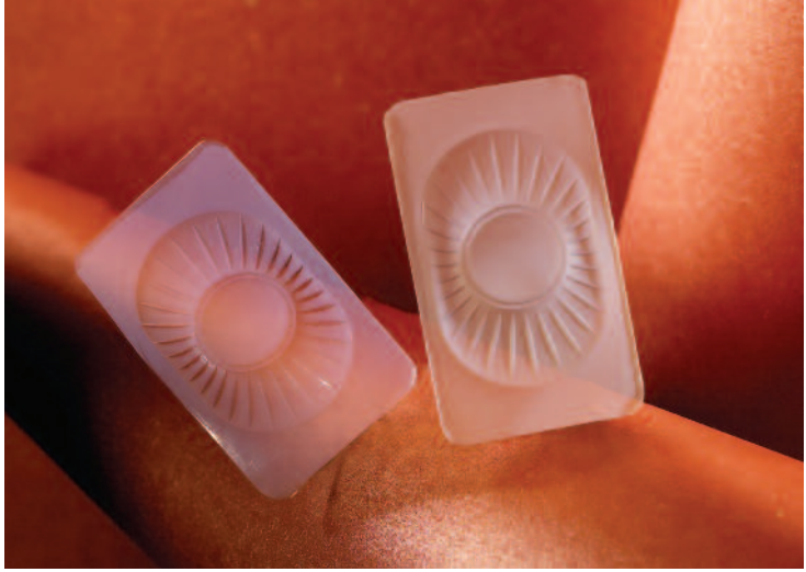
Cell phone speaker diaphragms

APTIV film is available in several grades according to the specific needs of the end use application. Within each grade a broad range of thicknesses are available from 6 to 750 microns. The standard width of APTIV film is 610 mm, although some films can be provided in widths up to 1500 mm. The stock rolls of film can be further slit down to widths of as low as 45 mm. Matte/Gloss and Gloss/Gloss surface finishes are standard. Other surface finishes are available upon request.